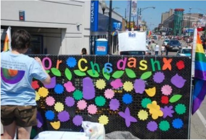
View from the top of the float