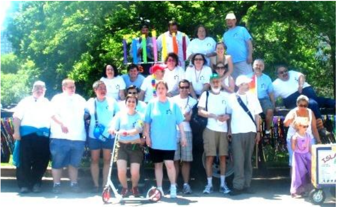
And so Pride 2011 comes to a close But the pride our members show never ends