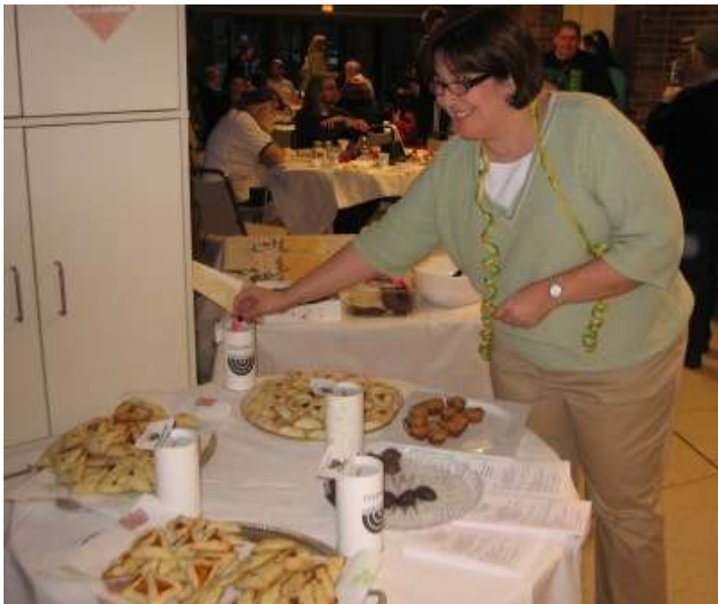
So many Hamantashen, so little time-See the Purim article on page 5