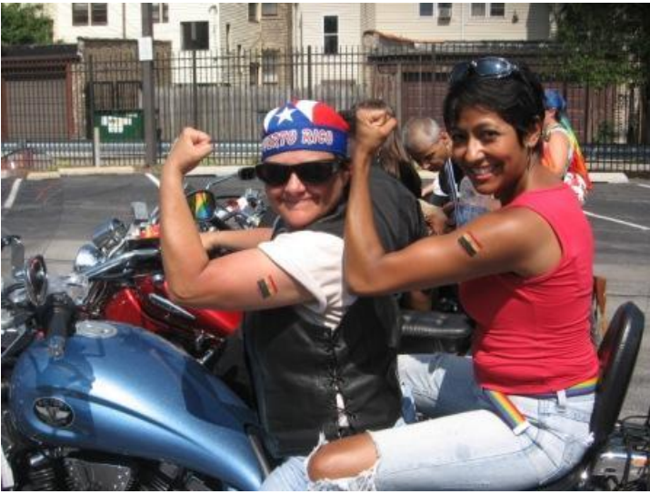
Or Chadash temporary tattoos lookin' good in the Dyke March