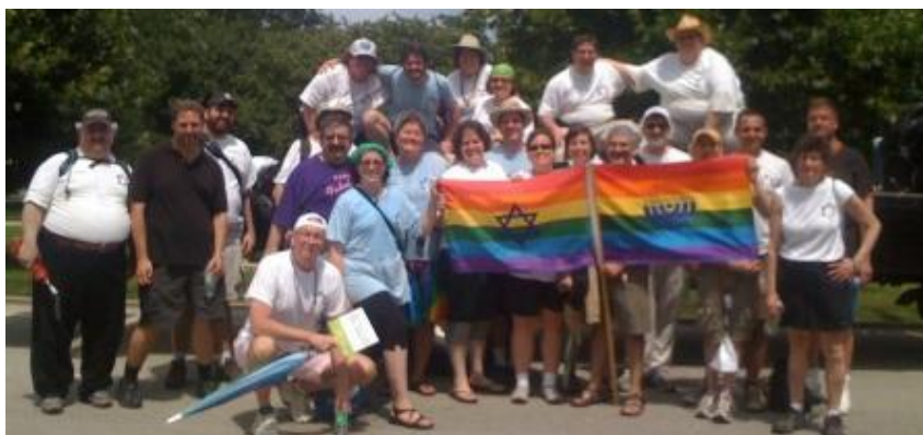
A group of which you can be proud

I take note of this very partial list to remind us that most of the organized Jewish community is with us on these issues. Perhaps there are ways we can support their efforts to support us.