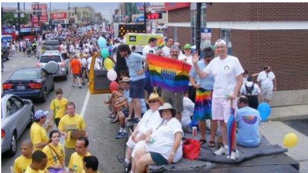
Hurry up and wait

The day started out looking bad, but just as the parade was to start the sun came out and it became a beautiful summer day to go for a ride, within sight of the Stanley Cup. Could not ask for more.